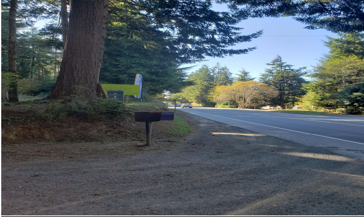
Sight distance looking south