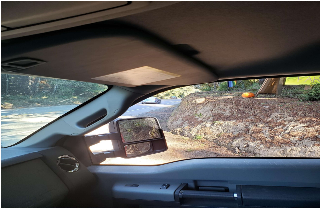
Sight distance looking north