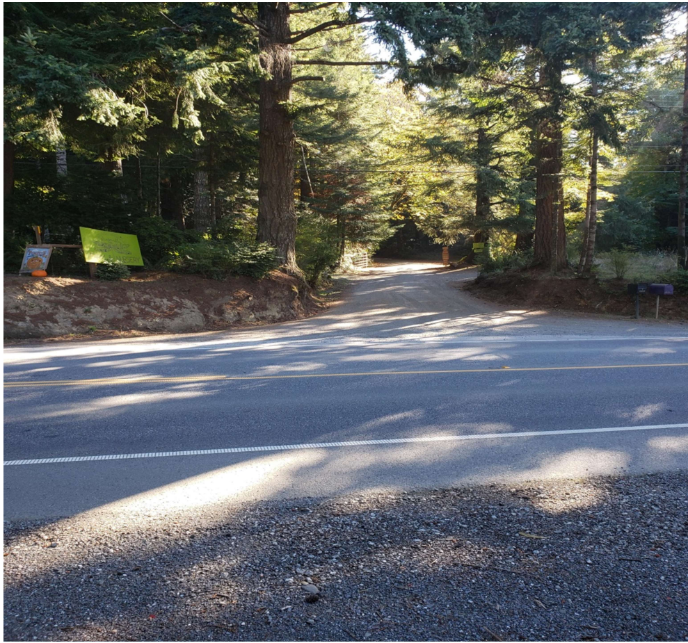
Dragonfly Farms Access From Highway 101

Finding: The retail nursery has a private access which fronts onto Highway 101 (see photo below). According to the applicant, measurement of the frontage of the access point is 47 feet. This finding is met.